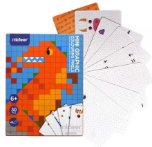
MIDEER - MINI GRAPHIC - COLOURING PIXELS Price: R120.00