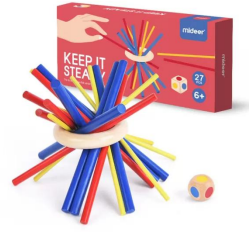
MIDEER - PICK UP STICKS - KEEP IT STEADY - 27PCS Price: R165.00