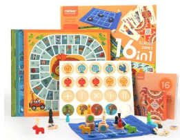
MIDEER - BOARD GAMES - 16-IN-1 CLASSIC GAMES Price: R649.00