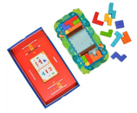
MIDEER - 5-IN-1 JUNGLE TETRIS BLOCK LOGIC CHALLENGE Price: R599.00