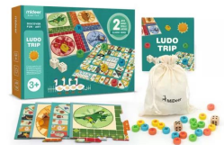
MIDEER - BOARD GAME 2-SIDED - LUDO TRIP Price: R199.00