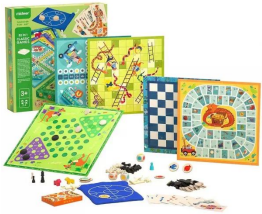
MIDEER - 32-IN-1 CLASSIC GAMES SET Price: R699.00