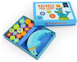
MIDEER - BALANCING GAME - SEA LION Price: R260.00