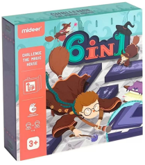
MIDEER - 6 IN 1 MAGNETIC BOARDGAME - CHALLENGE THE MAGIC HOUSE Price: R500.00