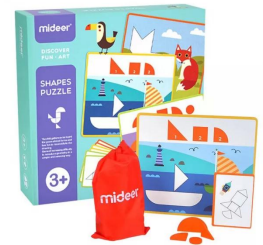
MIDEER - SHAPES PUZZLE - ACTIVITY GAME Price: R235.00