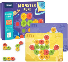
MIDEER - LOGICAL GAME MONSTER FUN! Price: R265.00